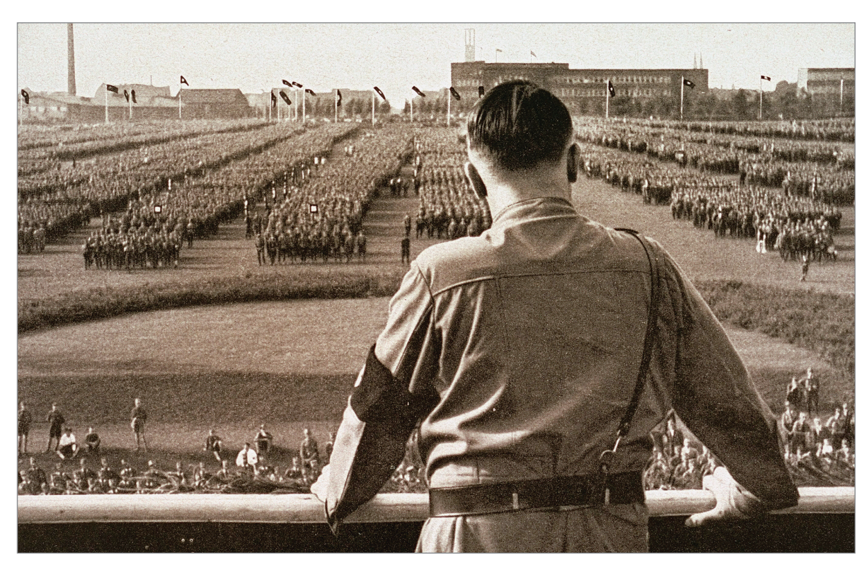
Adolf Hitler addresses a rally of the Nazi paramilitary formation, the SA (Sturmabteilung), in 1933. By 1934, the SA had grown to nearly four million members, significantly outnumbering the 100,000 man professional army.

The military played an important role in Germany. It was closely identified with the essence of the nation and operated largely independent of civilian control or politics. With the 1919 Treaty of Versailles after World War I, the victorious powers attempted to undercut the basis for German militarism by imposing restrictions on the German armed forces, including limiting the army to 100,000 men, curtailing the navy, eliminating the air force, and abolishing the military training academies and the General Staff (the elite German military planning institution).