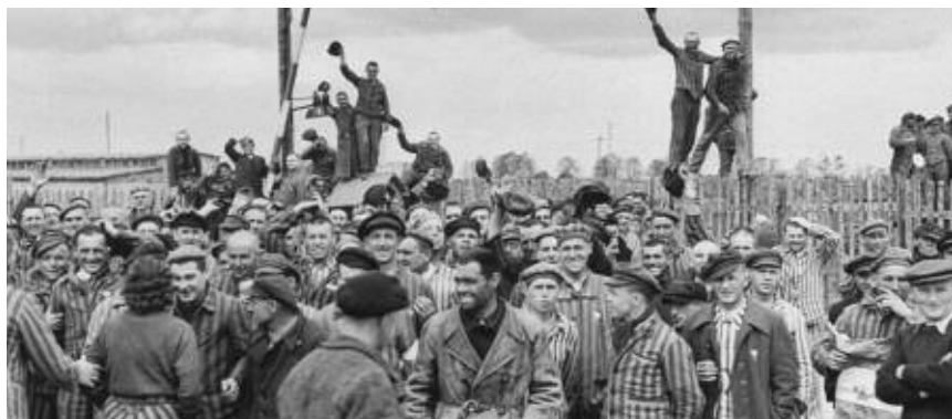
Liberated inmates of Allach, a subcamp of Dachau, greet troops of the U.S. Seventh Army (April 30, 1945).

In addition to those who rescued Jews were those who resisted the Nazis in various ways. The exhibition presents examples of resistance, both by non-Jews and Jews. The Nazis generally held entire families or communities accountable for acts of rescue and resistance, such as the assassination of Nazi leader Reinhard Heydrich. Because they suspected inhabitants of the town of Lidice (in Czechoslovakia) as having helped the assassins, the Nazis murdered the men of the town, deported the women to concentration camps, and deported many of the children to Poland. In all, the German occupiers killed approximately 3,000 Czechs in retaliation for the assassination of Heydrich. Of the groups in Germany that opposed Hitler’s dictatorship, only one, code-named White Rose, openly protested the Nazi genocide against Jews. The leaders of the White Rose movement, who were non-Jewish German students, were executed for treason in 1943. Between 1941 and 1943, Jews formed underground resistance movements in nearly one hundred ghettos. Jewish partisans fought Nazi Germany and its collaborators throughout Europe. In Auschwitz, Jewish concentration camp prisoners managed to blow up a crematorium. In Sobibór and Treblinka, they organized uprisings and mass escapes.