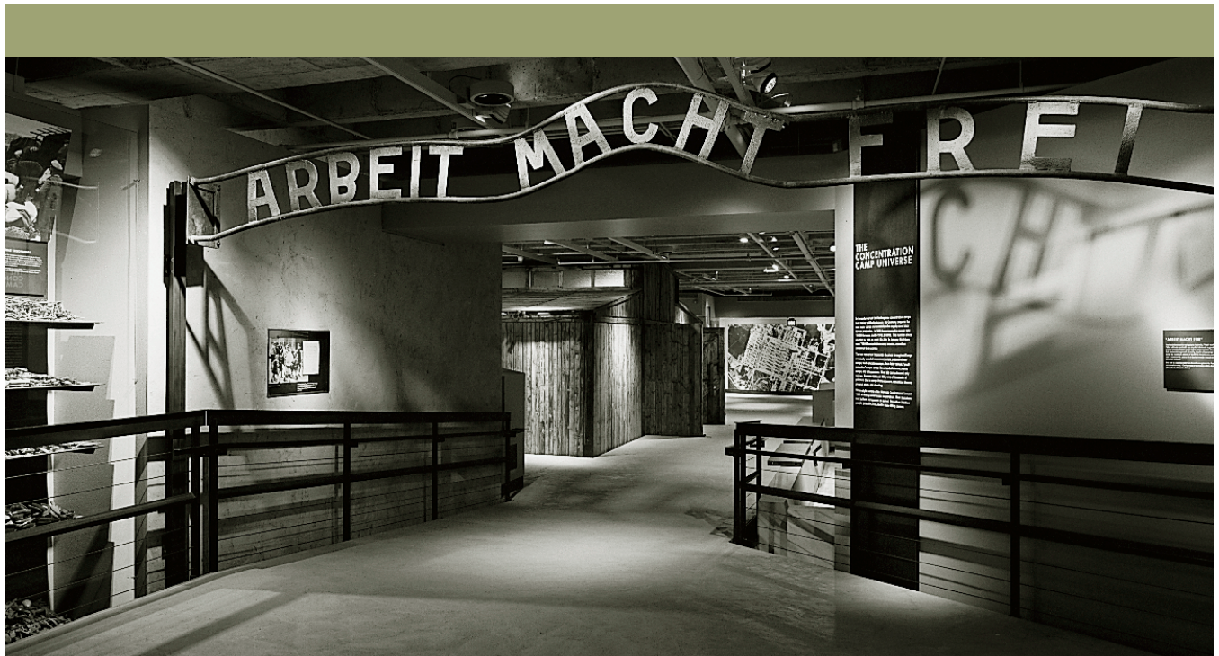
A casting taken from the gated entrance to Auschwitz I concentration camp. The inscription Arbeit Macht Frei means “Work makes one free.”