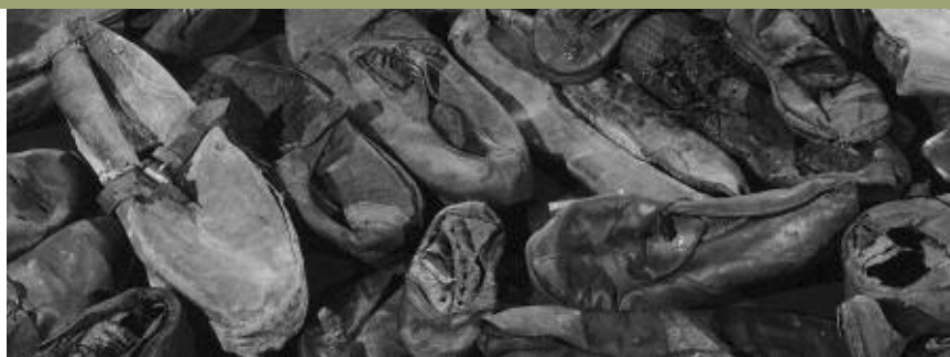
Shoes taken from victims at Majdanek.

NOTE: Near the end of this floor in the exhibition, visitors encounter shoes taken from prisoners at Majdanek; photographs of former prisoners' tattooed arms; a large photo mural of hair shorn from prisoners at Auschwitz; and castings of the crematoria and other items used to dispose of bodies in the concentration camps and killing centers.