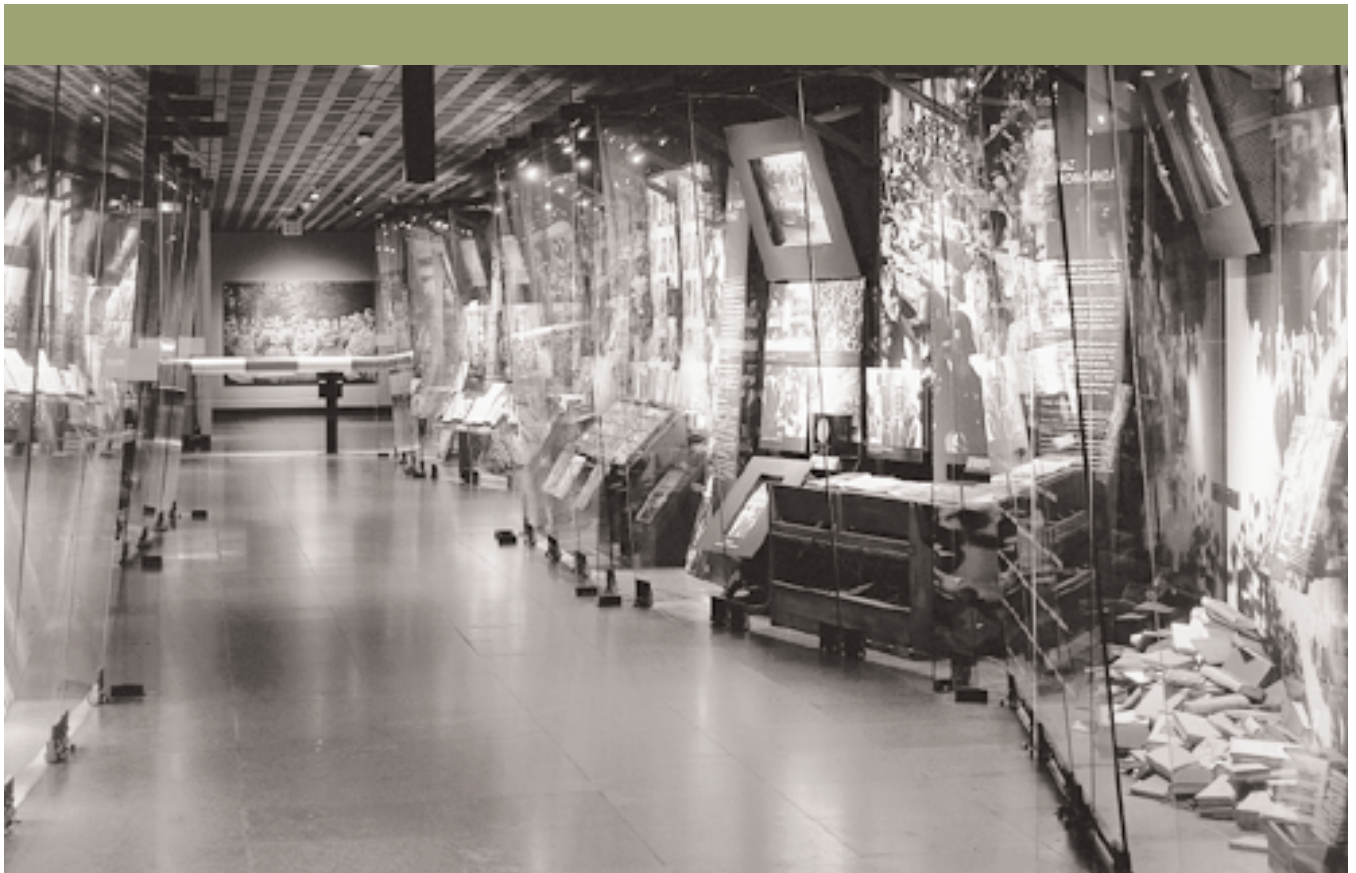
Exhibition display panels describe Nazi rule in Germany during the years 1933 to 1938.