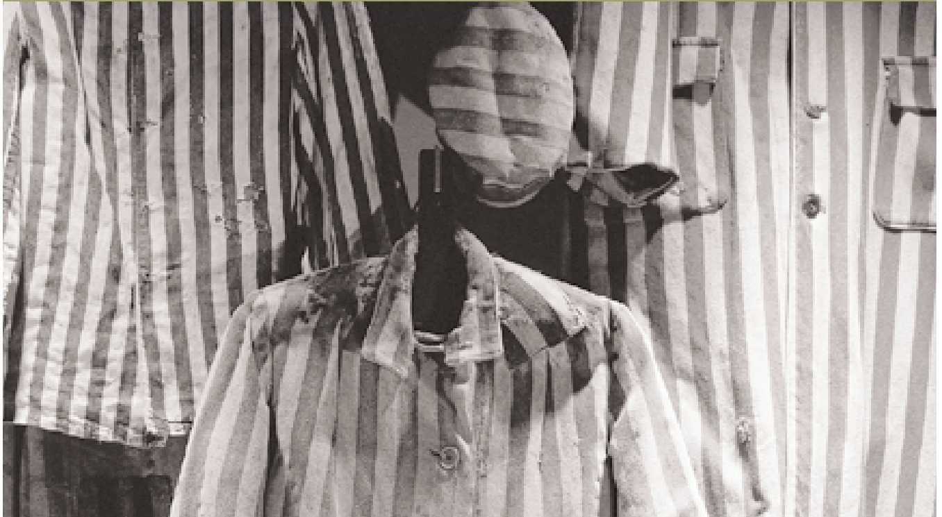
Uniforms worn by inmates of Nazi concentration camps.

To begin the Permanent Exhibition, visitors enter a large industrial-looking elevator. In the elevator, they see historical film footage on a video monitor and hear the voice of an American soldier describing his first encounter with a concentration camp in 1945, as World War II came to an end in Europe.