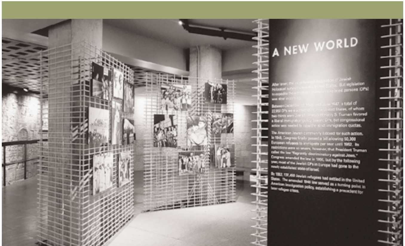
Exhibition display panels show survivors arriving in the United States after liberation.