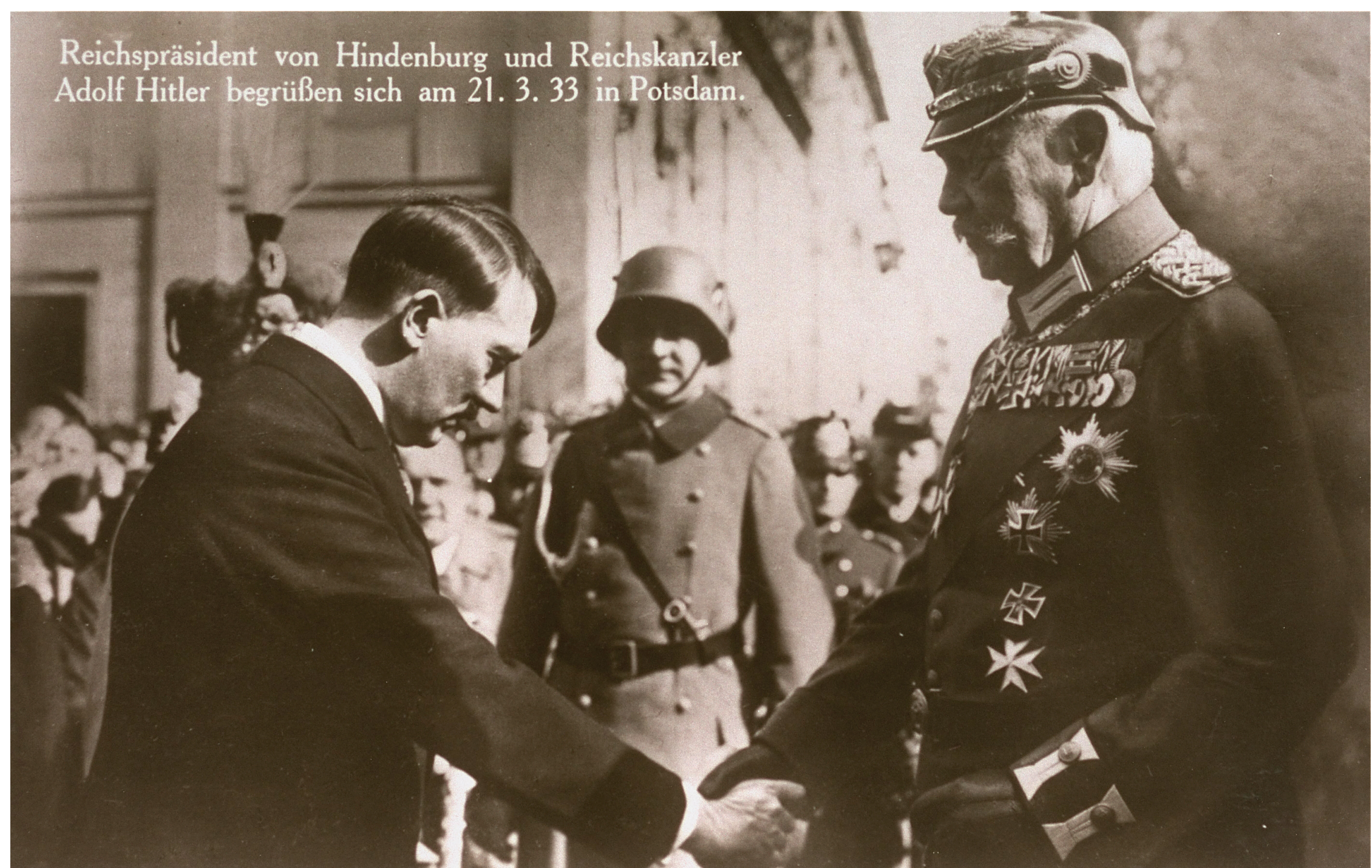
Reichspräsident von Hindenburg und Reichskanzler Adolf Hitler begrüßen sich am 21. 3. 33 in Potsdam.

The German Parliament (Reichstag) building in Berlin burns after an arson attack on February 27, 1933. Hitler blamed the Communist Party for the arson.