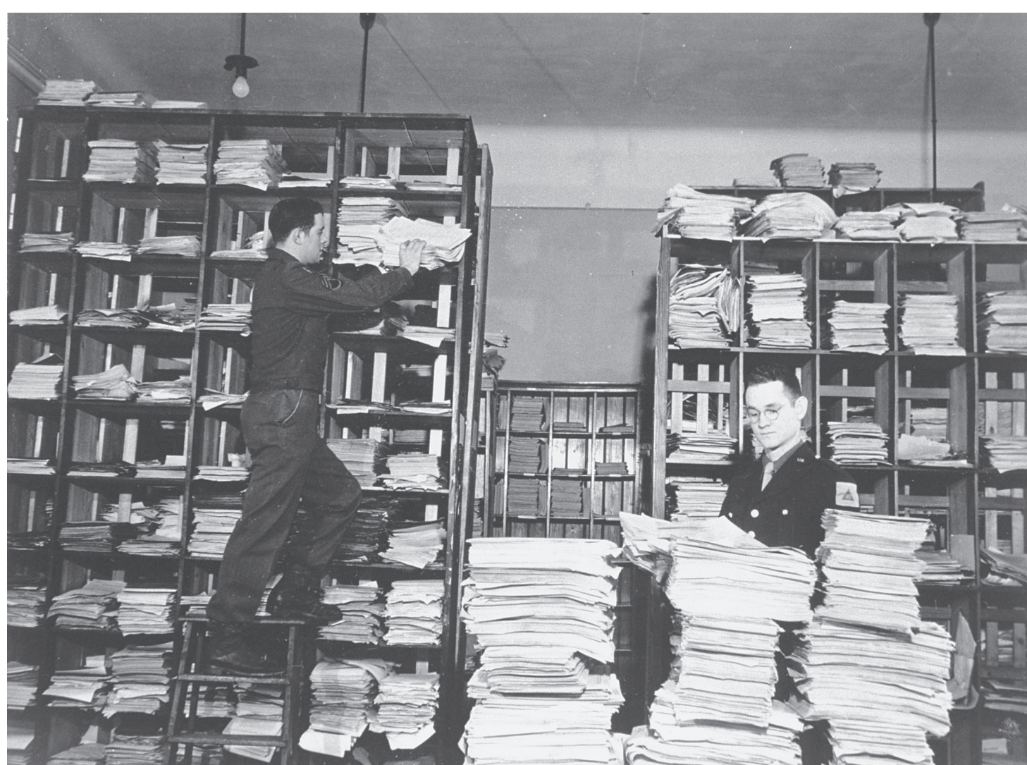
US Army staffers organize thousands of captured German documents as evidence for the IMT in Nuremberg, Germany, in 1945–46.

In November 1945, the Allies established the IMT in Nuremberg to try major Nazi offenders. In proceedings known as the Nuremberg Trials, the IMT prosecuted 22 high-ranking officials representing a cross section of Nazi diplomatic, economic, political, and military leadership. Evidence submitted at the trial included materials relating to the Holocaust, which the IMT classified as “crimes against humanity.” Twelve of the defendants were sentenced to death. The IMT sentenced seven defendants to prison terms ranging from ten years to life and acquitted the remaining three defendants. The Nuremberg Trials set an important precedent for future prosecution of crimes against humanity and genocide under international law. In subsequent trials, US military tribunals prosecuted more than 180 high-ranking Nazi officials under the auspices of the IMT. Numerous other Nazi offenders were tried by authorities in the countries where the crimes were committed. Many perpetrators, however, were never brought to trial or punished.