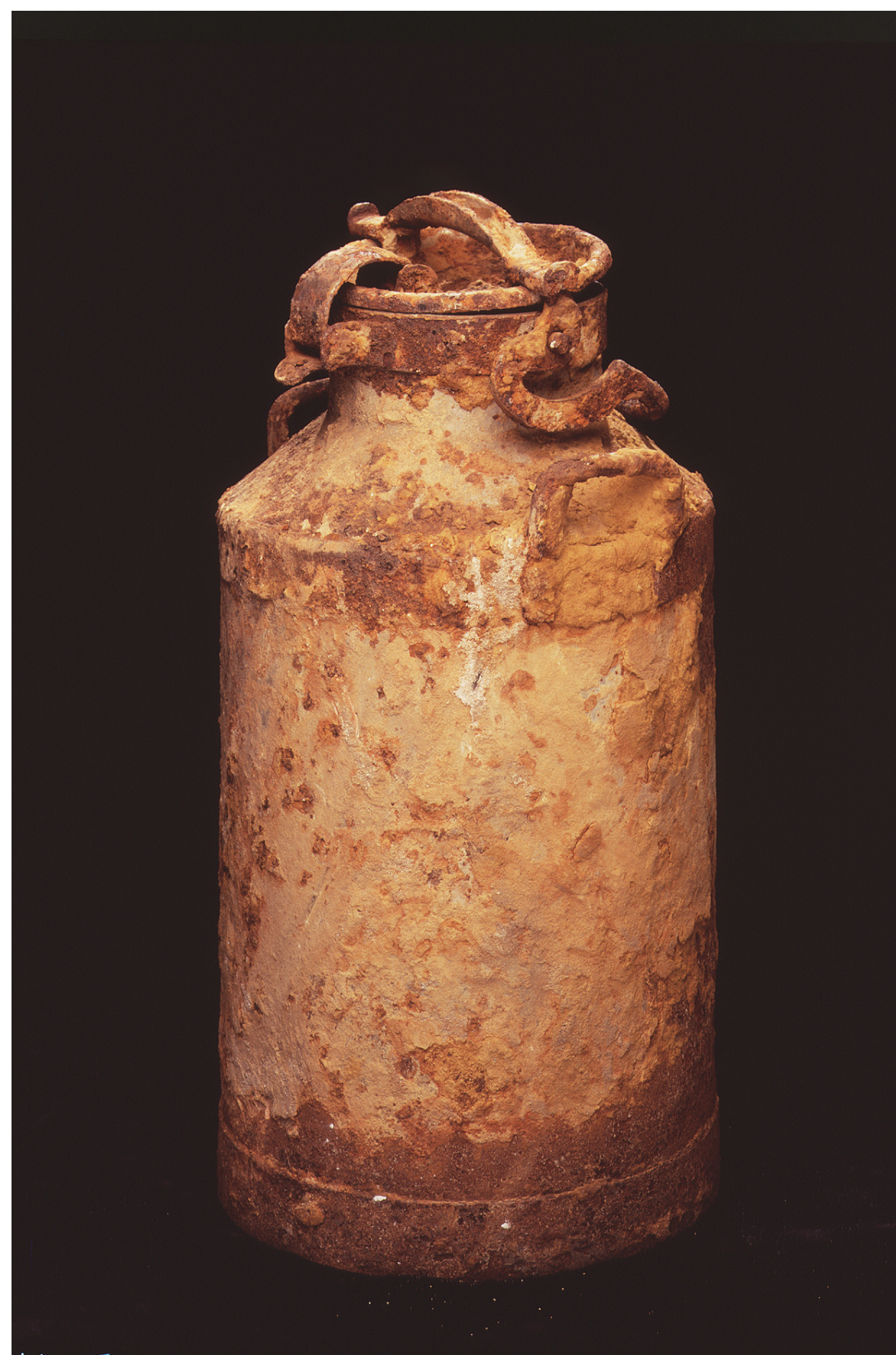
This milk can, which housed part of the Oneg Shabbat Archive, was recovered after the war.