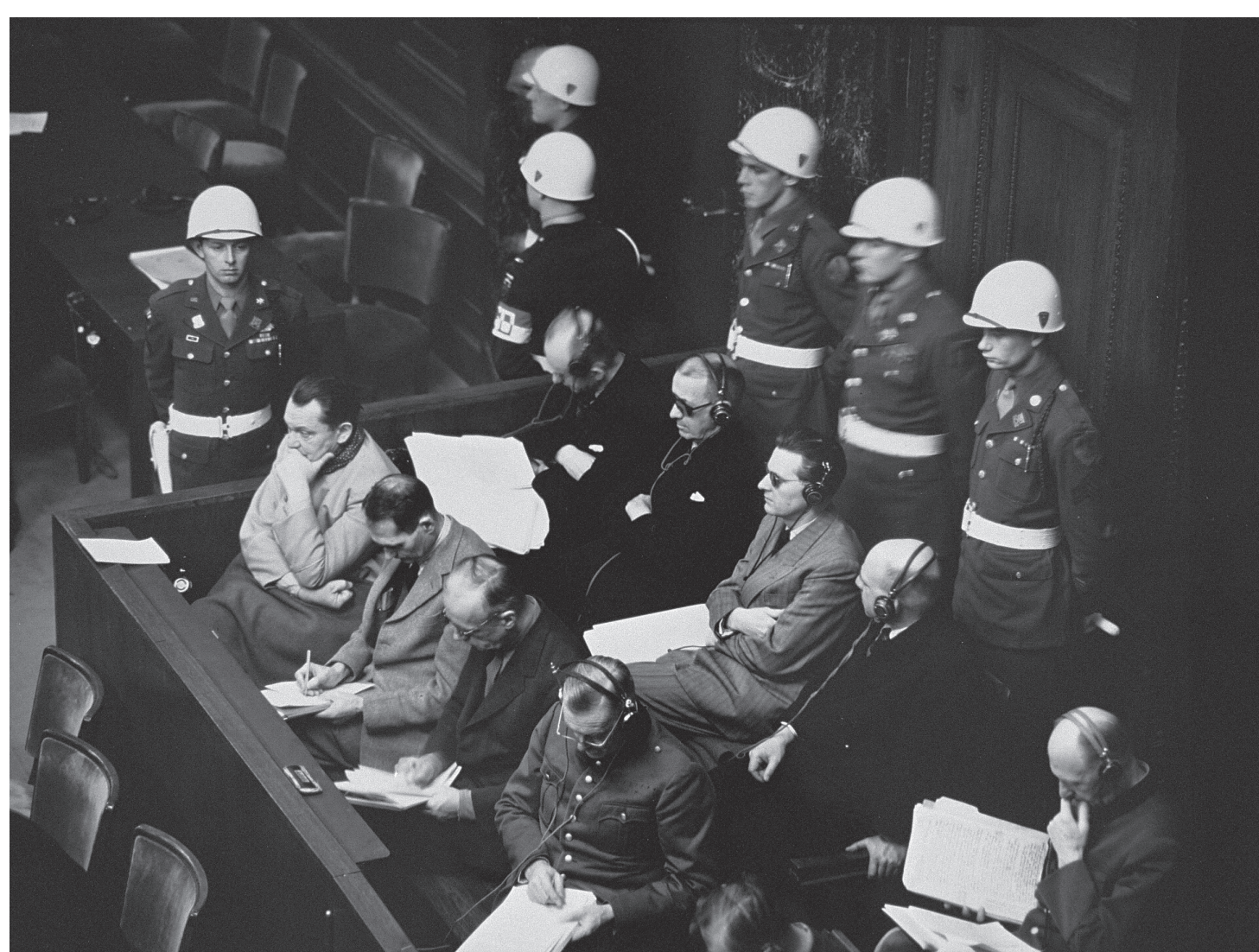
Defendants listen to the proceedings of the IMT in Nuremberg, Germany, in 1945–46.

In the aftermath of World War II, beginning with the International Military Tribunal (IMT) at Nuremberg, Germany, the Western Allies and the Soviet Union prosecuted those responsible for Nazi crimes.