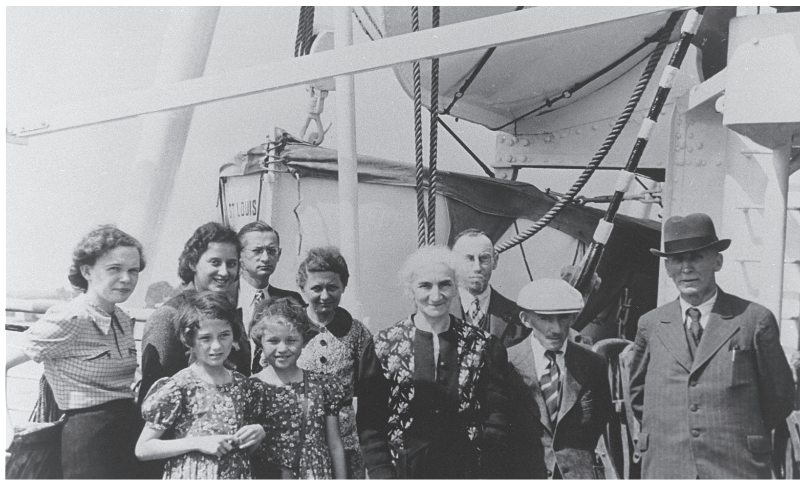
Passengers on the deck of the refugee ship St. Louis.

In May 1939, the transatlantic liner St. Louis sailed to Cuba with more than 900 Jewish refugees (pictured) from Nazi Germany. Denied entry into Cuba and turned away by the United States, the ship returned to Europe in June. The refugees were admitted by Belgium, France, Great Britain, and the Netherlands, but about one in four was killed in the Holocaust.