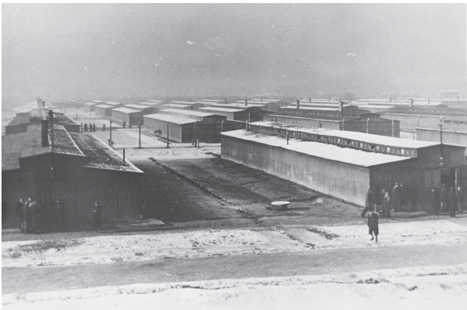
(Above) Barracks at Auschwitz-Birkenau in 1944.