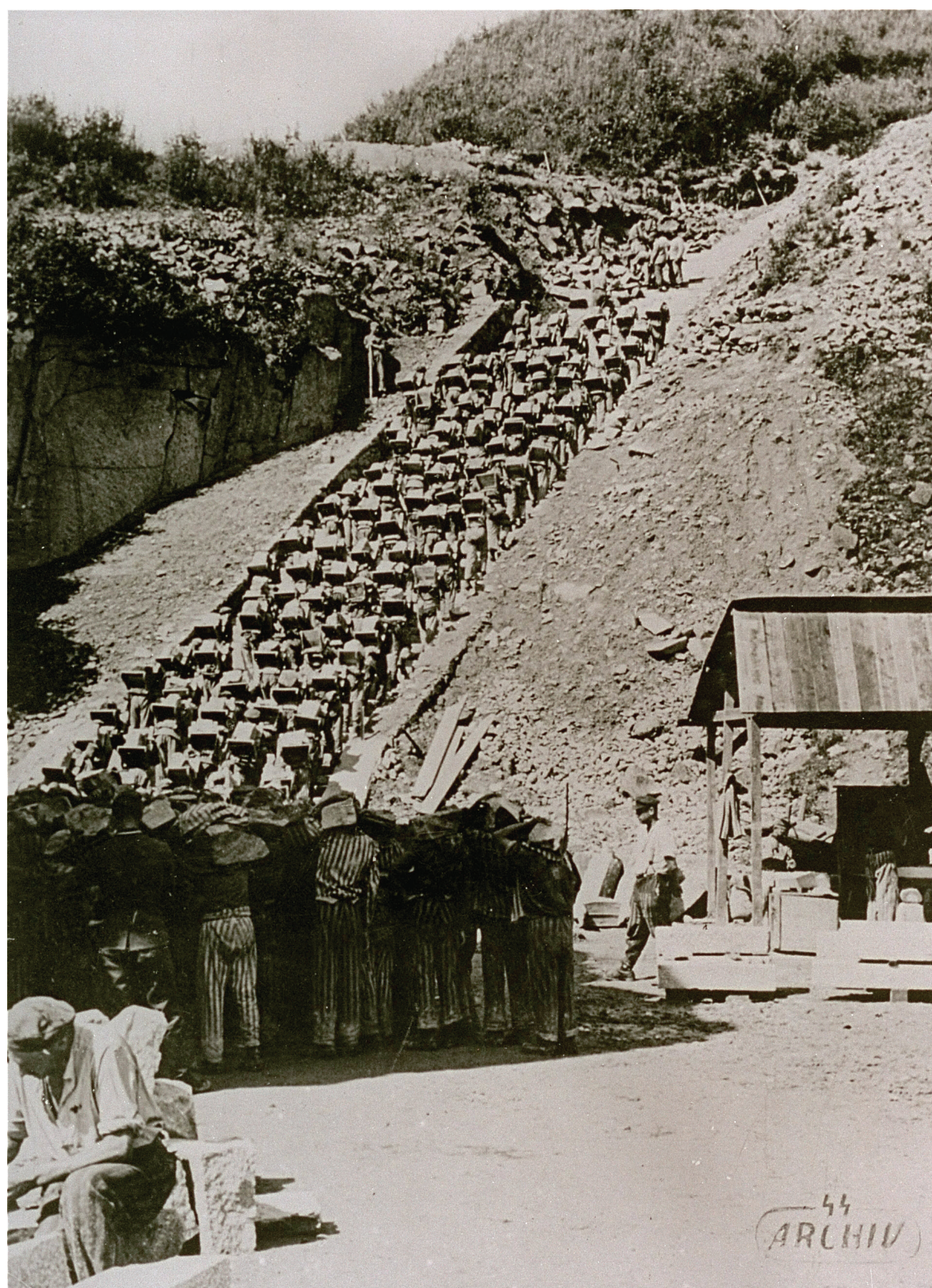
(Right) Prisoners carry large stones, each weighing more than 75 pounds, up the "staircase of death" at the Mauthausen concentration camp quarry in Austria in 1942.

The Nazis first established concentration camps to persecute political opponents as early as 1933. During World War II, the camp system expanded, targeting millions of supposed "enemies" of the Nazi regime. A central feature of these camps was forced labor , imposed without proper equipment, clothing, nourishment, or rest. Even when workers were needed, guards mistreated, starved, and killed hundreds of thousands of prisoners. Many more died from overwork, disease, and exposure.